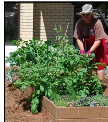
Master Gardener Volunteer working on raised bed in demonstration garden at Extension Office

4-H youth at school garden harvesting carrots