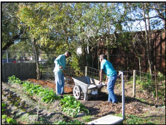
Residents at Superior Street Garden